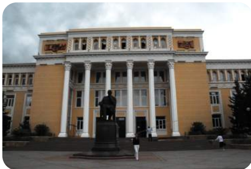
The Music Academy, Baku

further hone my inquiry and direct me to topics I will explore in my doctoral dissertation.