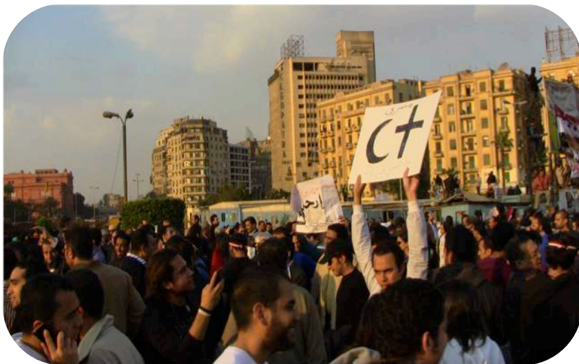
Protests by Muslims & Coptic Christians in Tahrir Square, Cairo, 2012

In my first PhD seminar as an incoming student of ethnomusicology six years ago (yikes!), there was no formal preparation on how to conduct ethnographic fieldwork during a national revolution! While I got many helpful tips on how to keep field notes, connect with interlocutors, and even how to survive a gastrointestinal cultural shock of sorts, there was no advice on how to blend into a crowd calling for their president of 30 years to step down. But I did just that.